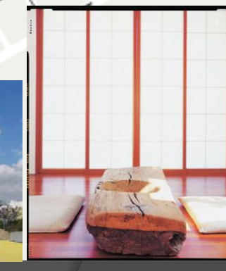
Janganpyong: Korean antique shopping area