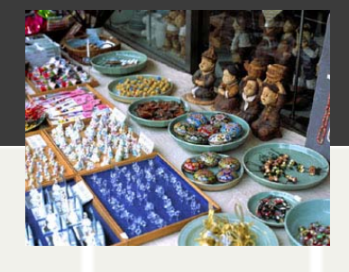
The Bank Of Korea