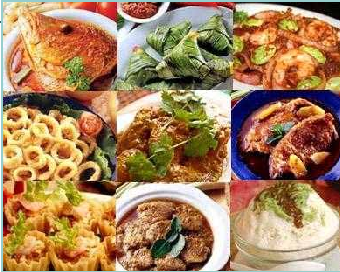
Nyonya Cuisine (Straits Chinese and Peranakan)