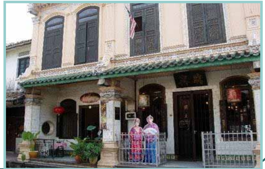
Baba-Nyonya Heritage Museum