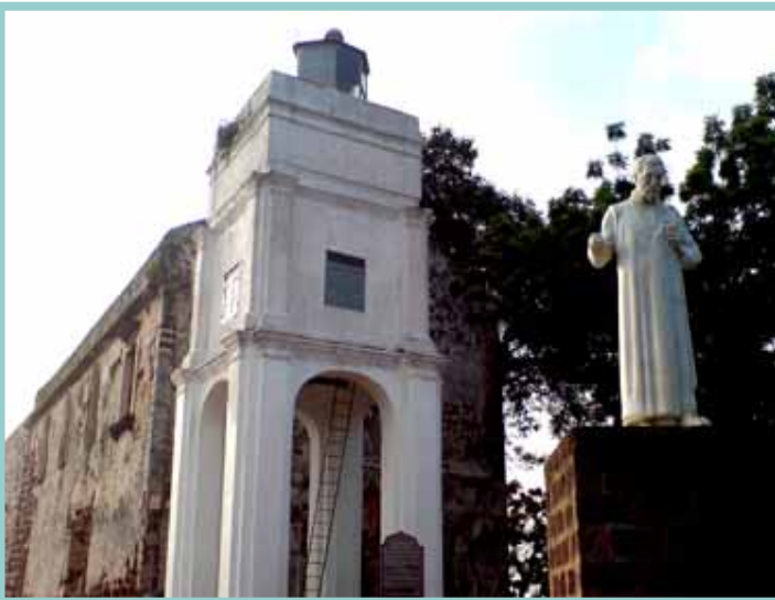
St. Paul Hill